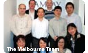
The Melbourne Team

Information regarding the SAP Implementation Project can be found on the Ramsay intranet site in the SAP Implementation Project section. ■