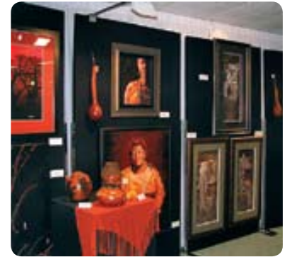
ABOVE RIGHT: Some of the amazing artwork on display during the Art Festival.