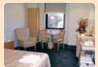
ABOVE: An example of the spacious, newly redeveloped patient rooms.

"With the purchase of state-of-the-art phototherapy units, isolettes and patient monitors, the special care nursery is providing the highest standard of care which is being appreciated by staff and paediatricians at the hospital." ■