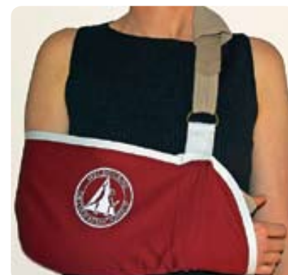
BELOW: One of the Sri Lankan manufactured slings.