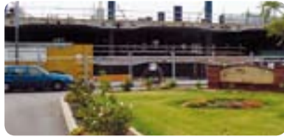
Above: Hollywood's multi-storey car park nearing completion.

A multi-storey car park is under construction at the eastern end of the hospital campus and is due for completion in July 2008. This will comprise of three levels plus ground floor with a total capacity in excess of 600 bays. Once the car park has finished, building of the